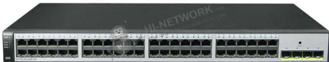
Figure 1 shows the appearance of S1720-52GWR-4P.