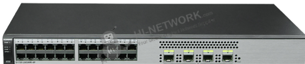
Figure 1 shows the appearance of S1720-28GWR-4P-E.