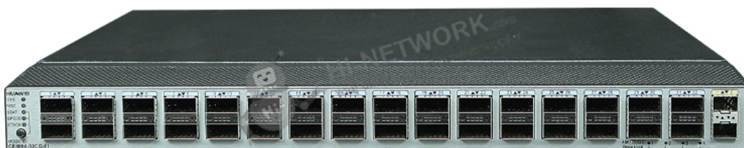
Figure 1 shows the appearance of CE8850-EI-F-B0A.