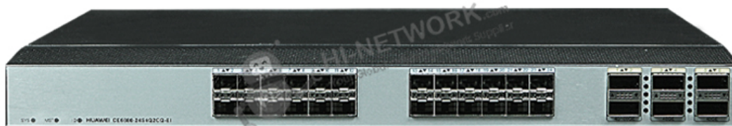
Figure 1 shows the appearance of CE6880-24S4Q2CQ-EI.