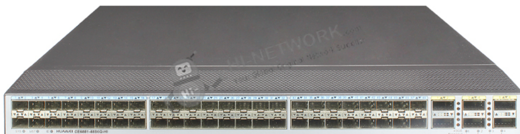
Figure 1 shows the appearance of CE6851-48S6Q-HI-X.