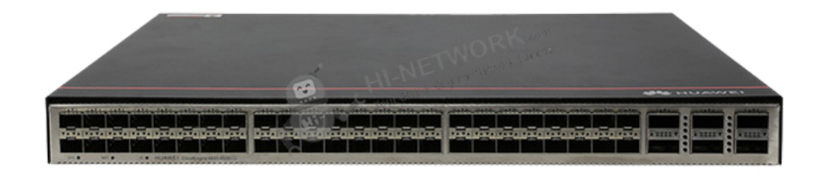
Figure 1 shows the appearance of CE6820-48S6CQ.