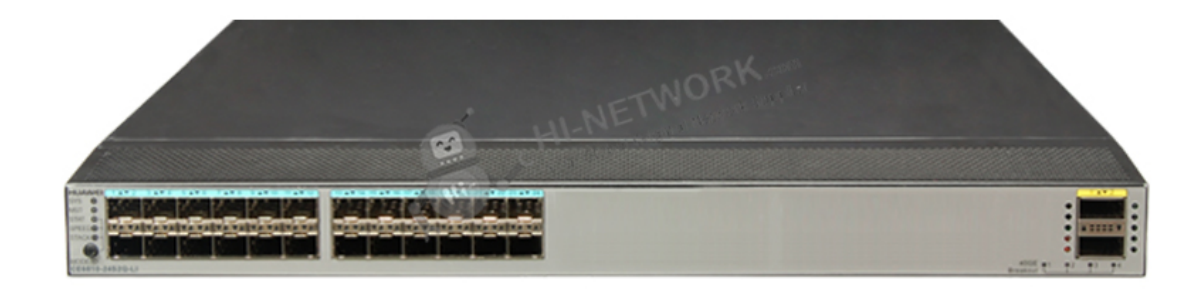
Figure 1 shows the appearance of CE6810-LI-B-B0C.