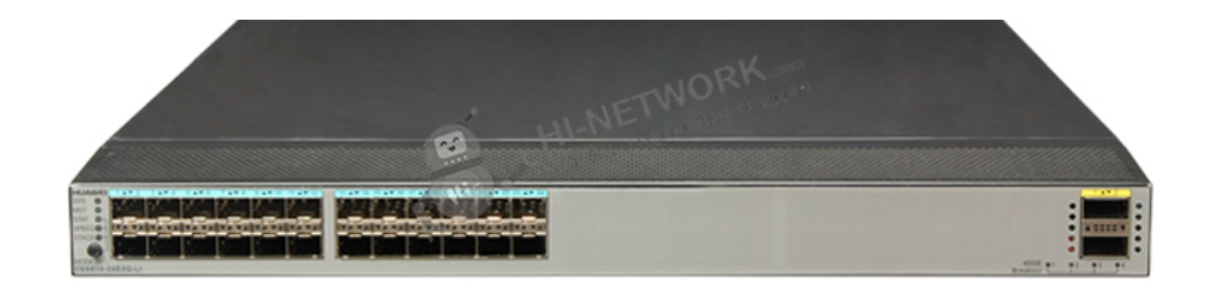
Figure 1 shows the appearance of CE6810-24S2Q-LI-F.