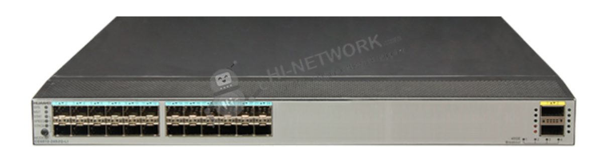
Figure 1 shows the appearance of CE6810-24S2Q-LI.