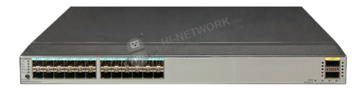
Figure 1 shows the appearance of CE6810-24S2Q-LI-B.