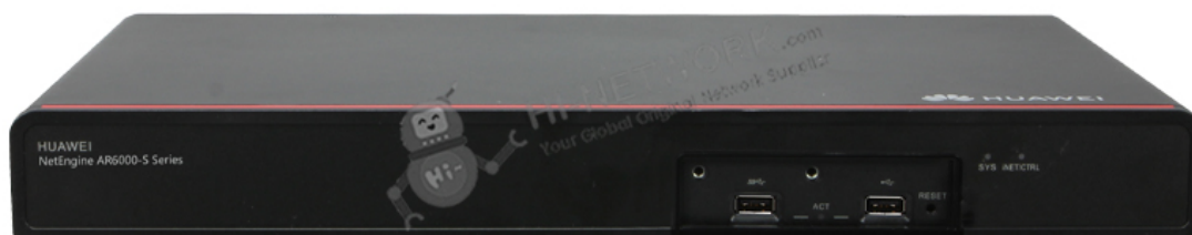
Figure 1 shows the appearance of AR6120-S.