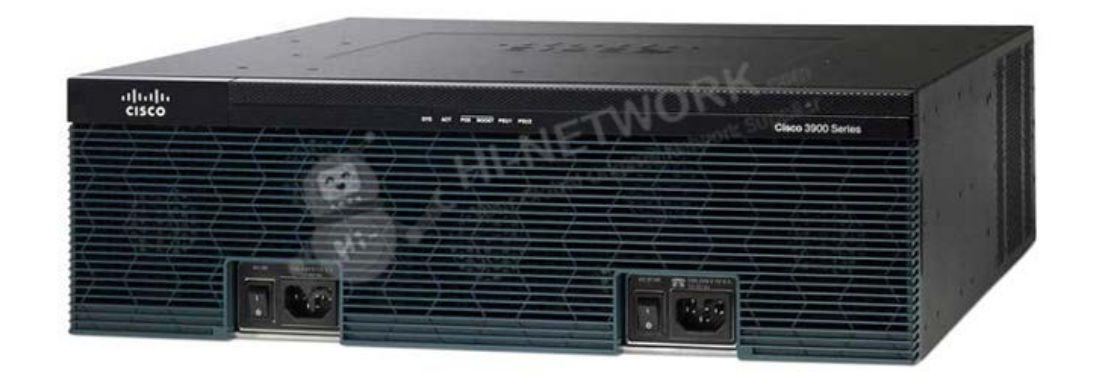
Figure 1 shows the appearance of the Cisco 3925 router for reference.