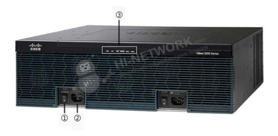
Figure 2 shows the front panel of the Cisco 3925 router.