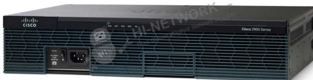
Figure 1 shows the front view of CISCO2911-SEC/K9.