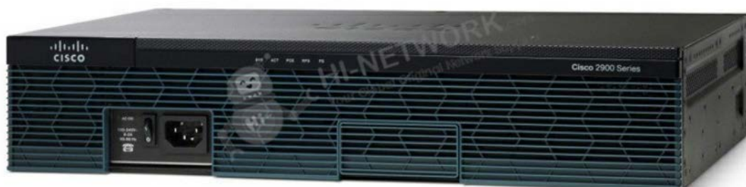
Figure 1 shows the product appearance of Cisco2911-V/K9.