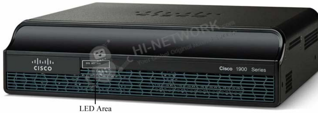
Table 2 shows the front panel LEDs area description.

Figure 2 shows the status LEDs, on the front panel of the 1941/K9, including three statuses: SYS, ACT and PoE.