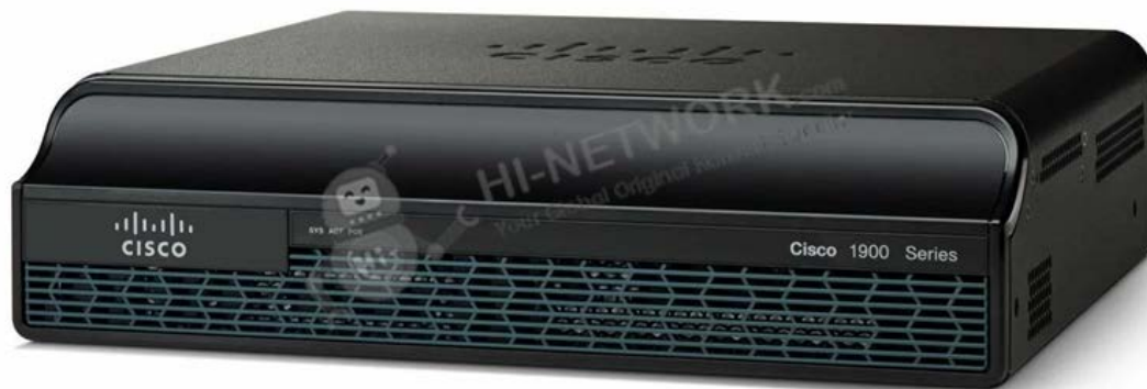
Figure 1 shows the front view of Cisco Router 1941/K9.