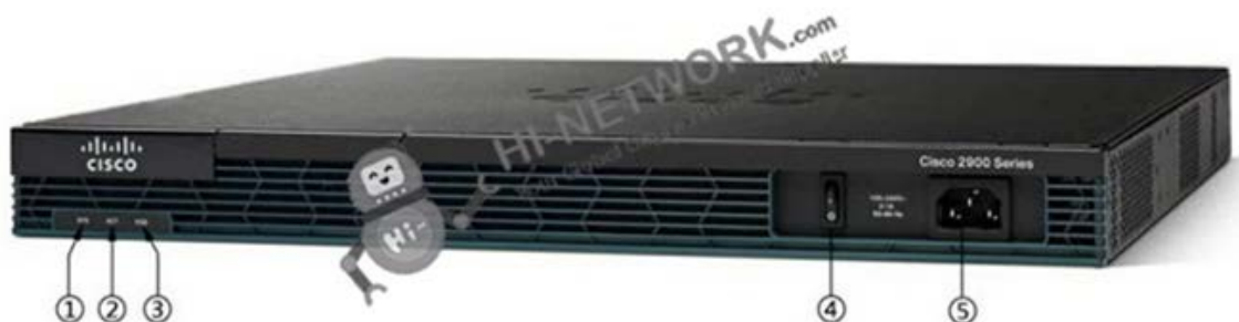
Figure 1 shows the front panel of the Cisco 2901 router with ports and LEDs. C2901-VSEC/K9 is similar with it.