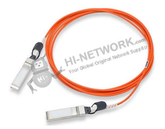
Figure 1 show the appearance of SFP-10G-AOC5M.