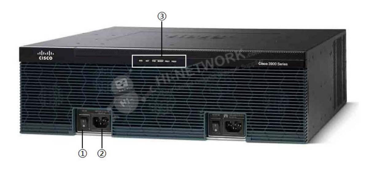
Figure 2 shows the front panel of the Cisco 3945E router.