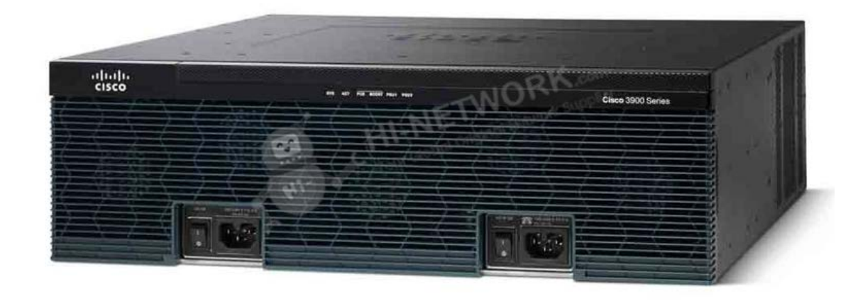
Figure 1 shows the appearance of the CISCO3945E/K9.