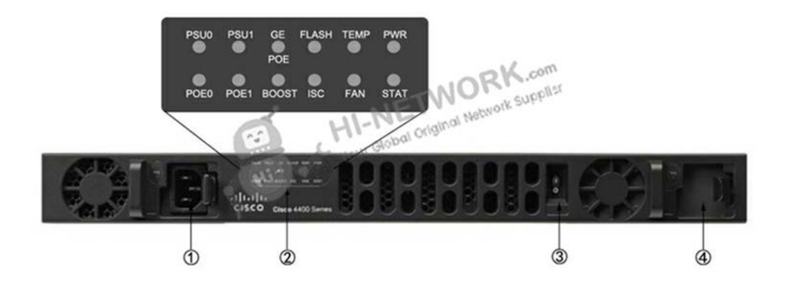
Figure 2 shows the front panel of Cisco ISR4431-SEC/K9.