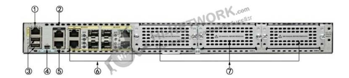
Figure 3 shows the back panel of Cisco ISR4431-SEC/K9.

· LEDs include 12 indicators: PSU0, PSU1, GE/POE, FLASH, TEMP, PWR, POE0, POE1, BOOST, ISC, FAN, and STAT.