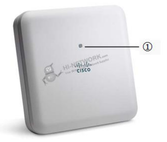
Figure 1 shows the AIR-AP1832I LED Indicator Position.