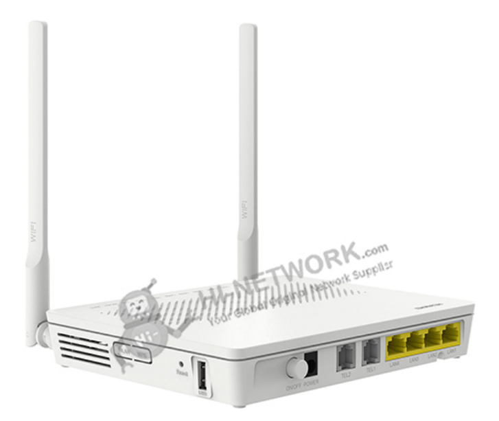
Figure 1 shows the appearance of EchoLife HG8245H.