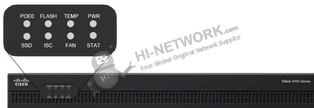
Figure 2 shows the LEDs on the front panel of the Cisco ISR4321/K9.