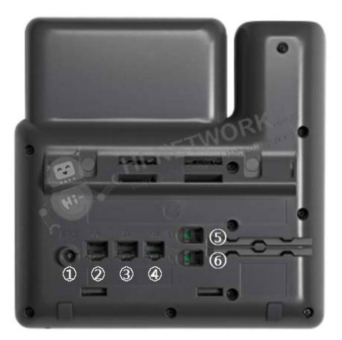
Figure 2 shows the bottom ports of this IP Phone.

Before you use the Cisco IP Phone 7841, it should be connected to the corporate IP telephony network.