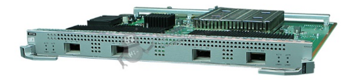
Figure 1 shows the appearance of ES1D2H02QX2S.