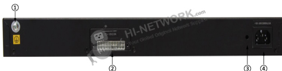
Figure 3 shows the back panel of S5700-28TP-PWR-LI-AC.