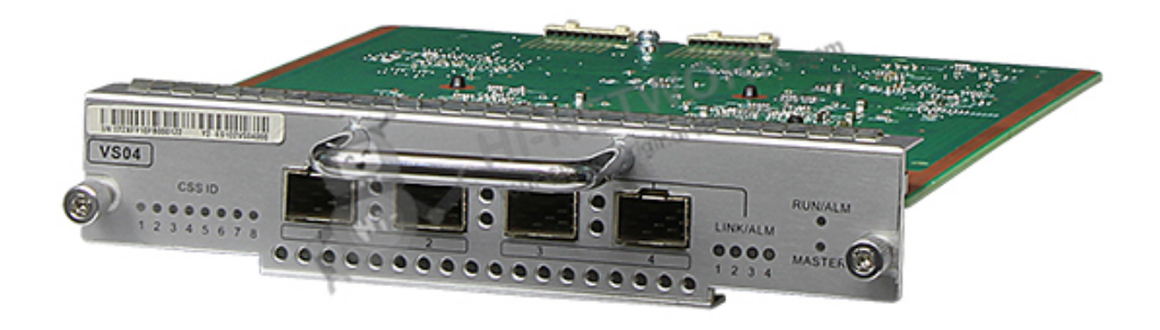
Figure 1 shows the appearance of ES1D2VS04000.