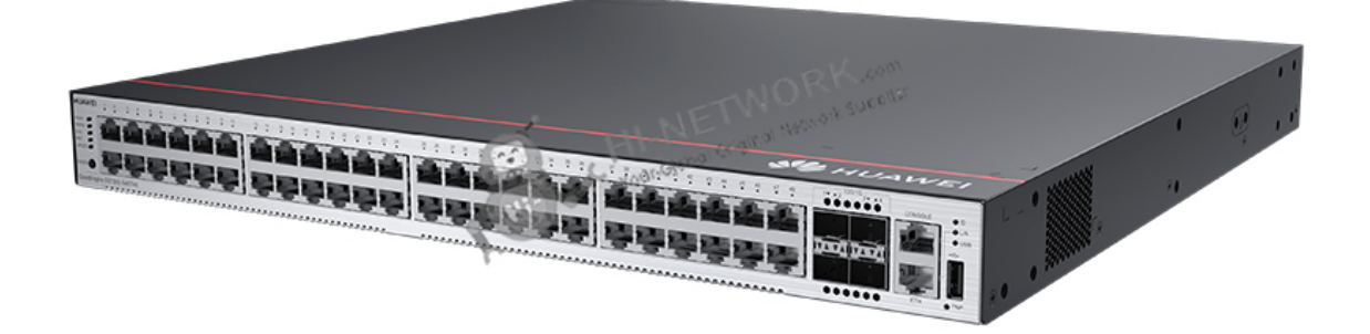
Figure 1 shows the appearance of S5735S-S48T4X-A.