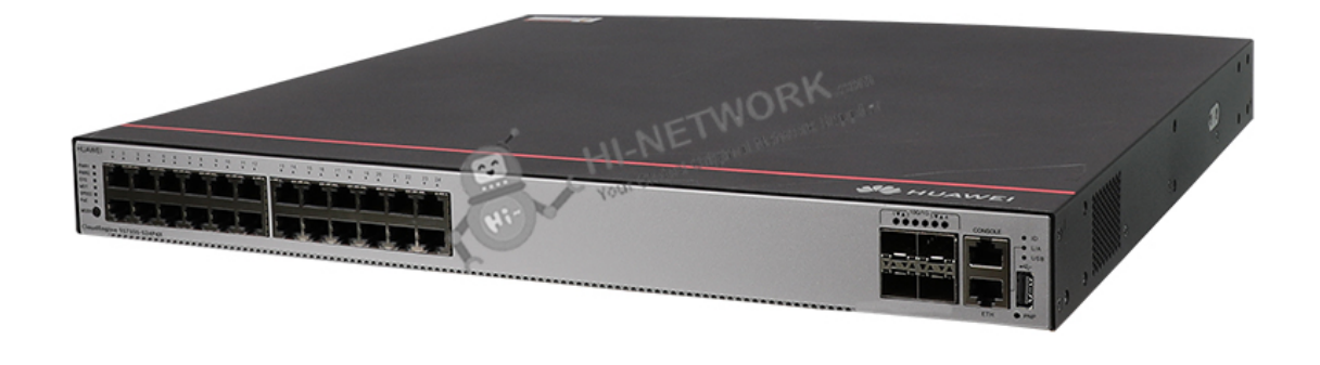
Figure 1 shows the appearance of S5735S-S24P4X-A.