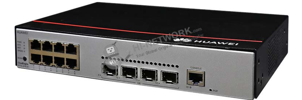
Figure 1 shows the appearance of S5735-L8T4S-A1.