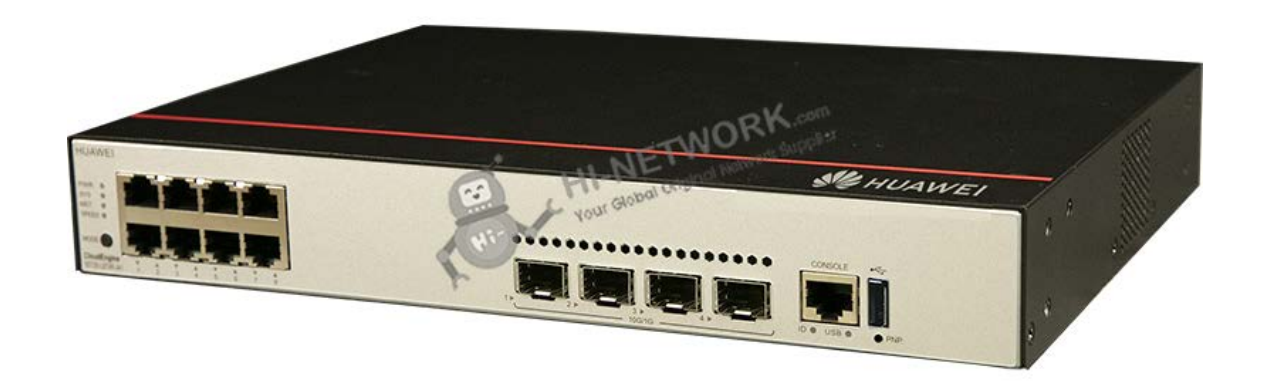
Figure 1 shows the appearance of S5735-L8T4X-IA1.