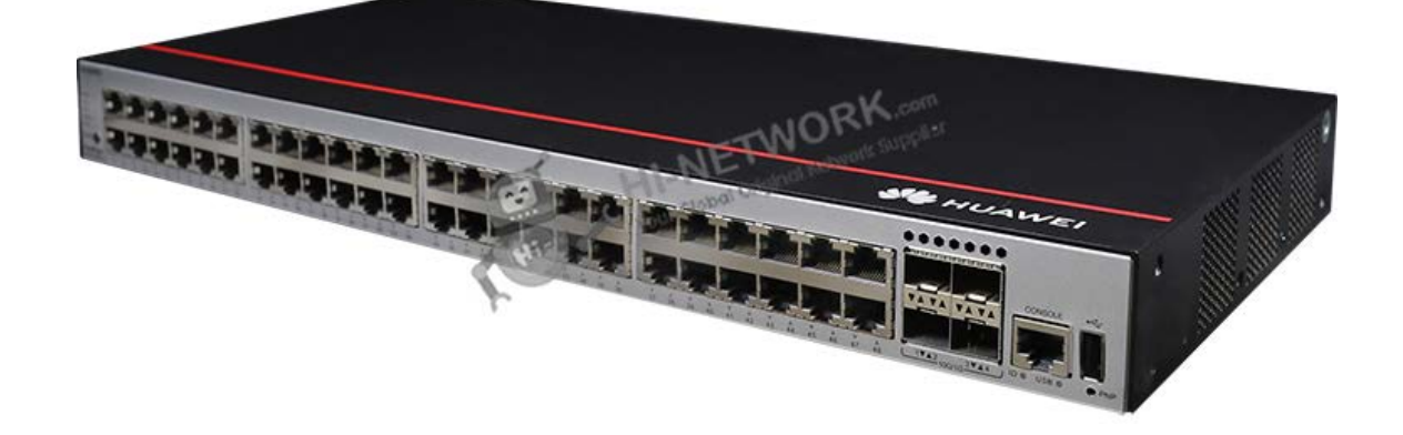
Figure 1 shows the appearance of S5735S-L48P4X-A1.